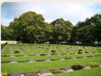
Imphal War Cemetery