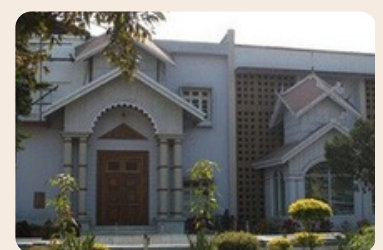
Manipur State Museum